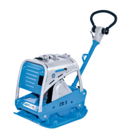
Dimensions in mm.